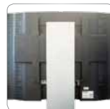
Neatly finished back side