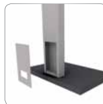
Easy player access