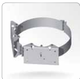
Available for multiple screen mounting