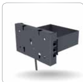
Available for square columns