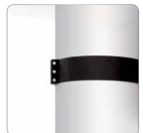
No drilling needed