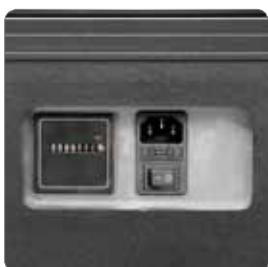
Run time registration

Please refer pricelist to www.audipack.com for updated models