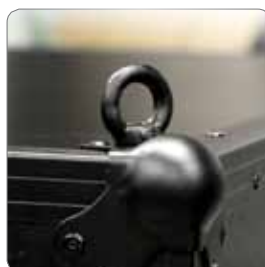
Optional crane hooks, for ceiling mounting