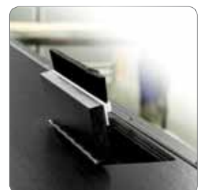
Neatly installed cables